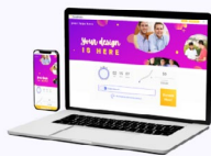
Fun & Feminine

Select your design! (out of 20 beautiful templates)