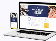
Elegant & Royal